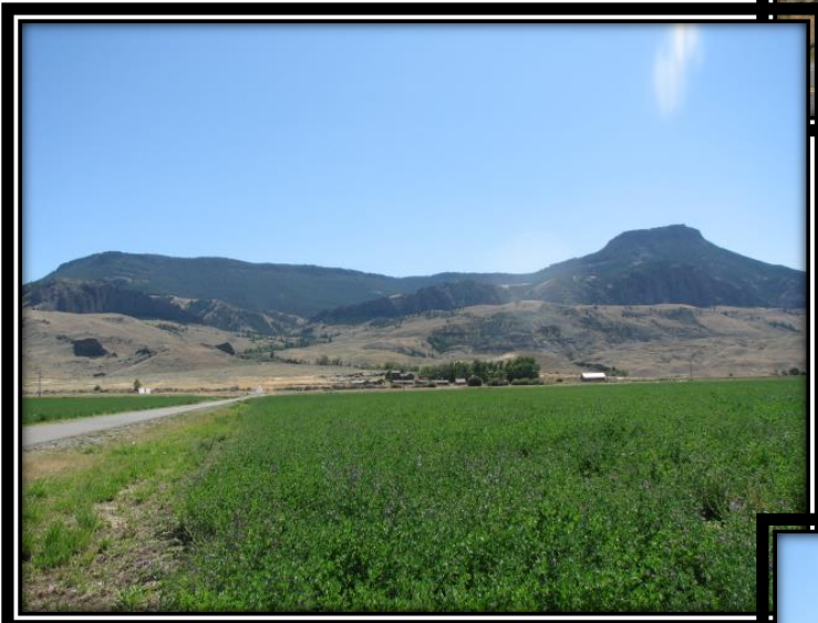
Production Ground And Mountain Views