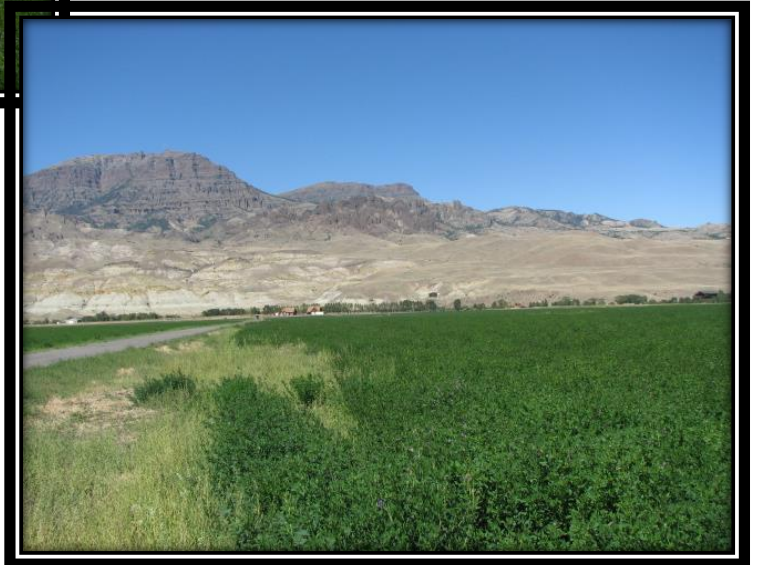
Production Ground with View of Jim Mountain